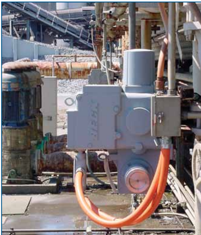
Recycle Water Control Valve

Beck actuators offer easy installation and can be mated to almost any final control element. Years of experience and expertise make it possible for Beck to custom fabricate all types of mounting hardware, adaptors and pedestals for simple drop-in replacement. Beck ensures a trouble-free installation.