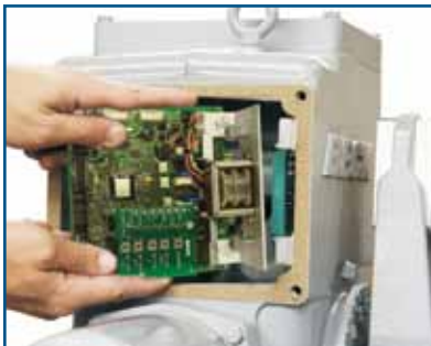
Digital Control Module (DCM)

Beck's Contactless Position Sensor (CPS) also resides within the drive, and provides reliable internal position feedback to the DCM-2 for position control. The DCM-2 also uses the sensor signal to source a 4–20 mA external position signal for remote monitoring of drive position. Unlike typical position sensors, the CPS does not wear due to its contactless design.