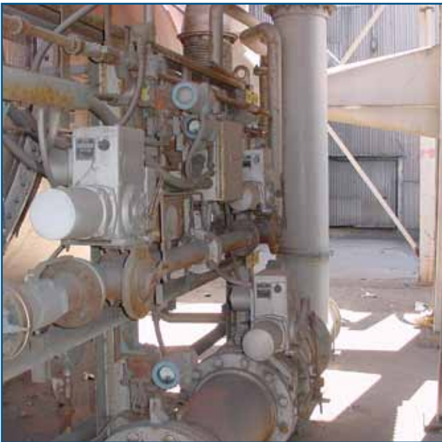
Stove Enrichment Gas Valves