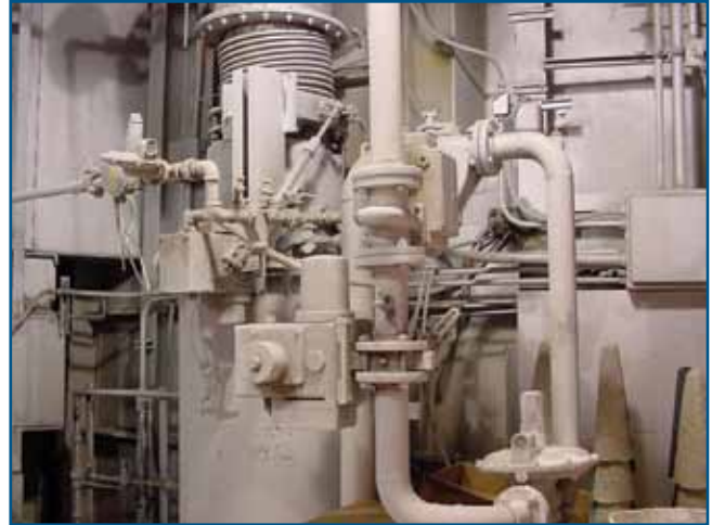
A & P Line Gas Valve