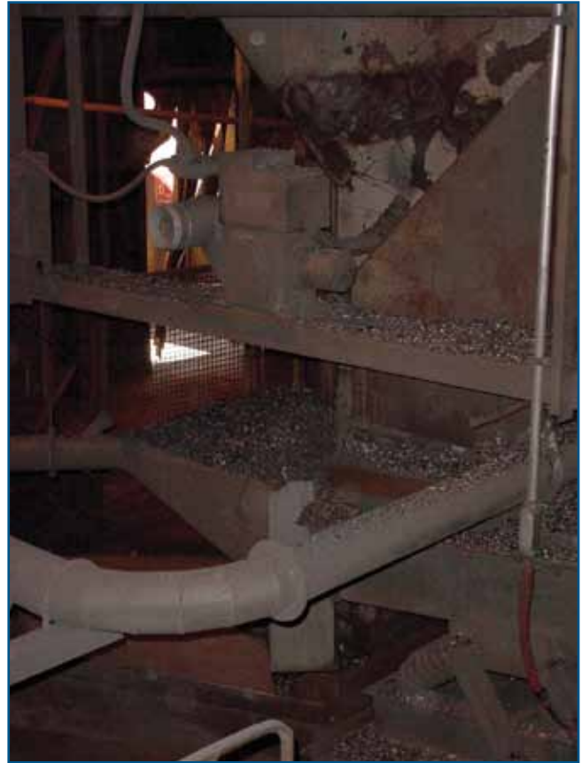
Sinter Plant Fines Gate Control