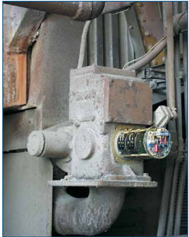
Group 11 drive with the gasketed control end cover removed