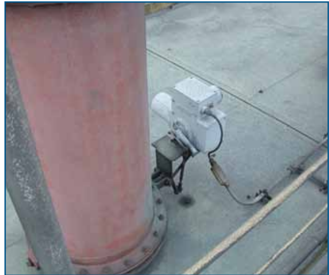
Lime Kiln Primary Air Damper