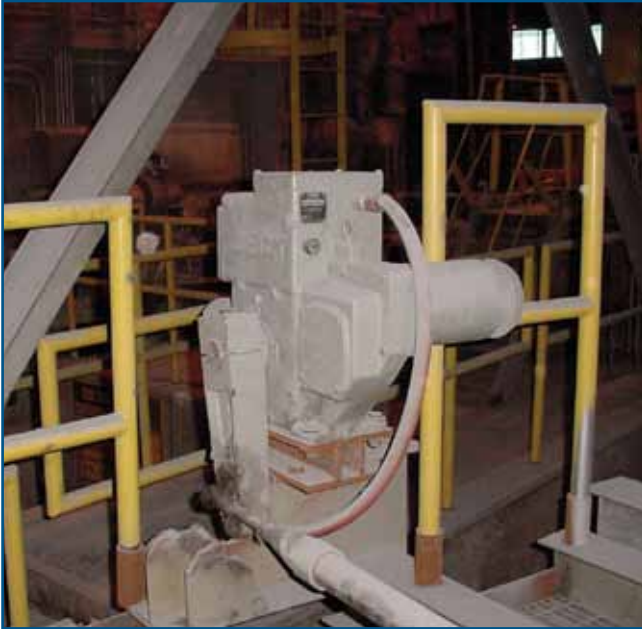
Reheat Furnace Exhaust Damper