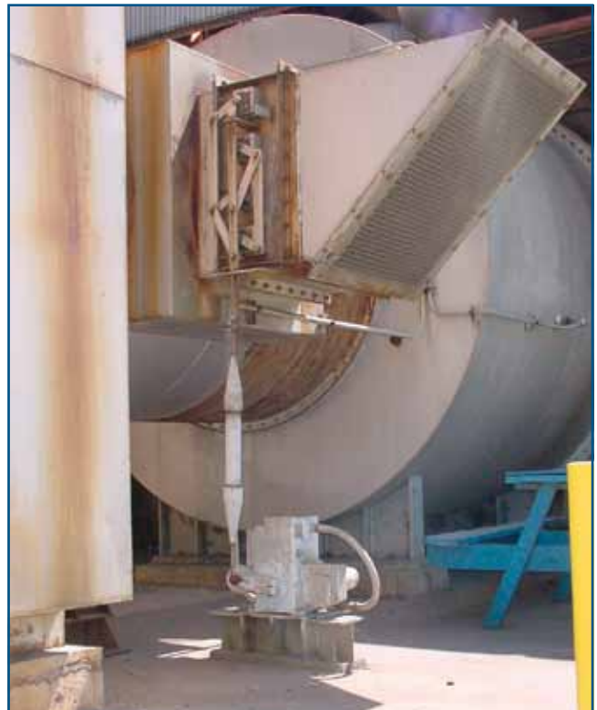
Melt Shop Fume Control Tempering Air Damper

Beck's Link-Assist™ program provides a printout showing the optimum actuator and linkage configuration for the application. The linkage arrangement can be characterized to match the torque profile of the application. Request this free service to save time, simplify installation and ensure the best performance at the lowest possible cost.